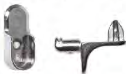
Closet rod clip and Earthquake clip

For more detailed information about Lifespan Closets, visit our website at lifespanclosets.com or call us at (866) 961-0004.